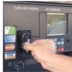
Automated payment system at the dispenser