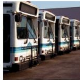
Natural gas powered buses