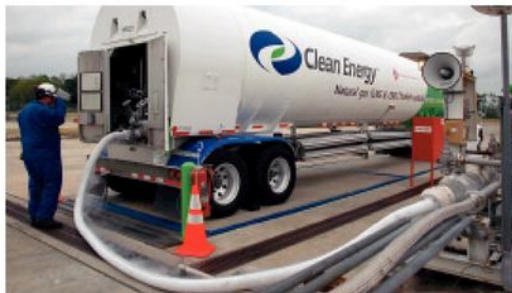
LNG tanker trailer