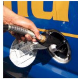
Dispensing CNG at fueling station