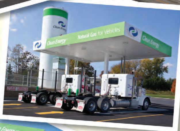
Mill Hall, PA