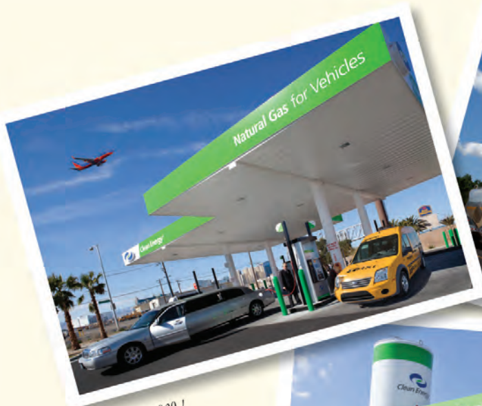
Las Vegas, NV