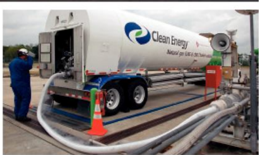
LNG tanker trailer