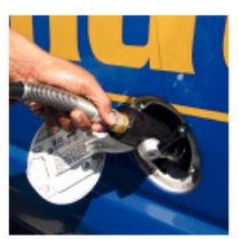
Dispensing CNG at fueling station