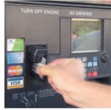
Automated payment system at the dispenser