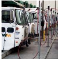
Natural gas powered refuse haulers