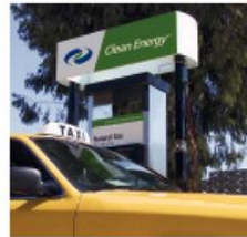
Small CNG fueling station