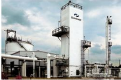
The Pickens Plant, an LNG liquefaction plant located in Willis, Texas