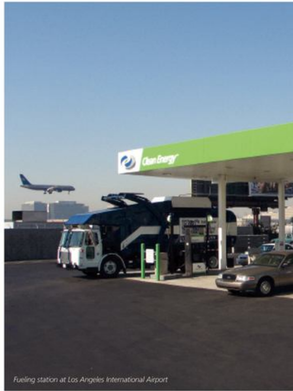
Fueling station at Los Angeles International Airport