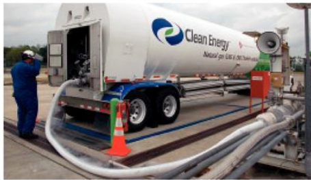
LNG tanker trailer