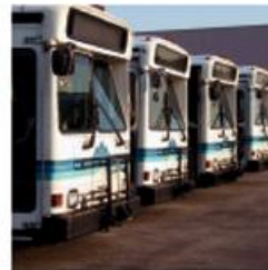
Natural gas powered buses