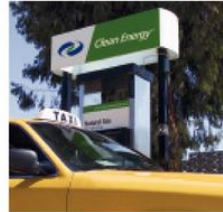
Small CNG fueling station