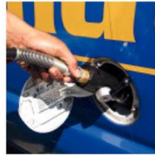
Dispensing CNG at fueling station